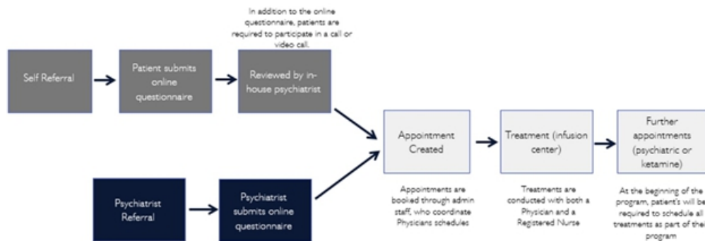
Figure: Pasitheia will operate under Zen Healthcare regulatory and will have no independent employees as a starting point but will hold its own indemnity and public liability in addition to the ones already present by Zen Healthcare and contractors. Future Pasitheia clinics will have a standalone registration with regulatory. The care quality commission, which regulates provision of treatments, will initially be under Purecare LTD (Zen Healthcare). In the future Pasitheia anticipates applying for a separate CQC registration once it has its own employees (e.g., doctors and nurses). Once this occurs, customer service agents will be employed / contracted by Pasitheia UK. Psychiatrists who conduct the psychiatric evaluation will be contracted by Pasitheia UK GP's (MD) and nurses who will be conducting the infusions will be employed by Zen Healthcare, who are contracted by Pasitheia.

Specifically, in the UK, our operation processes are as follows: